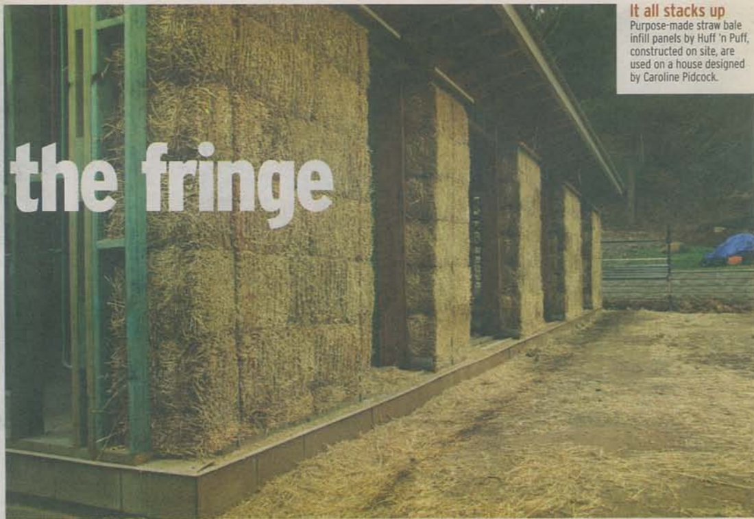
It all stacks up Purpose-made straw bale infill panels by Huff 'n Puff, constructed on site, are used on a house designed by Caroline Pidcock.

Unlike the first little pig's experience, straw bale has proven to be a durable and sustainable material, removing the need for