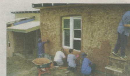
Straw bale Once the bales are up, it's an easy matter of rendering to the desired look.