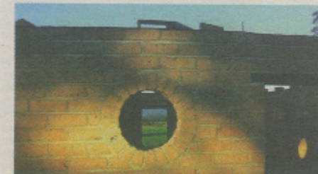
Mud brick Bellingen Bricks' product, made from red sandstone, clay and cement, is four to six times the size of a house brick.