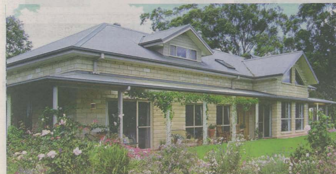
Beauty on a budget At first glance it looks like sandstone, but this house is in fact made of the highly fire-resistant and practical Timbercrete blocks.