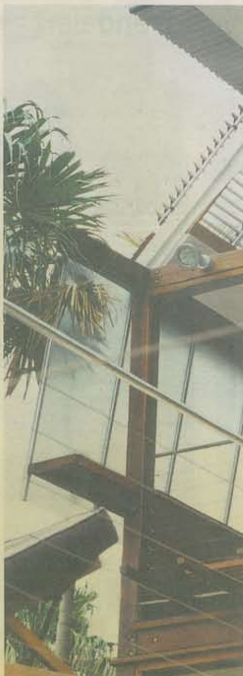
RAINWATER TANKS, WATER-SAVING SHOWER HEADS AND SOLAR ENERGY ARE KEY INCLUSIONS UNDER THE BASIX BUILDING SUSTAINABILITY INDEX.