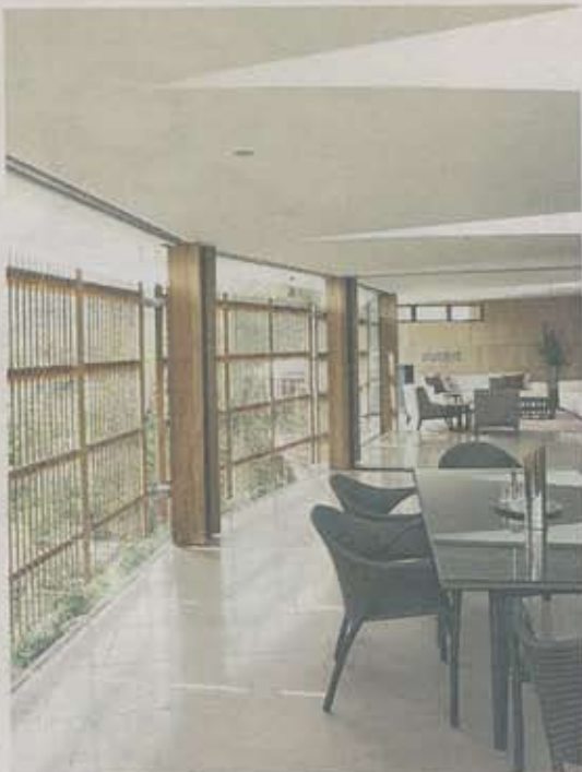
CLEVER USE OF DINING SCREENS IN AN ENERGY-EFFICIENT HOUSE BY ARCHITECT MICHAEL ROBILLIARD.

BASIX basics Building Sustainability Index (BASIX) was introduced in July 2005 to ensure new houses are more energy- and water-efficient. New houses must have water-saving taps and shower heads. Many properties now have water tanks connected to the toilet and laundry. Eaves, orientation and shading are priorities in house design to reduce power usage. BASIX requires all new houses in NSW to produce up to 40 per cent less greenhouse gases than the average home. For more information see www.basix.nsw.gov.au .