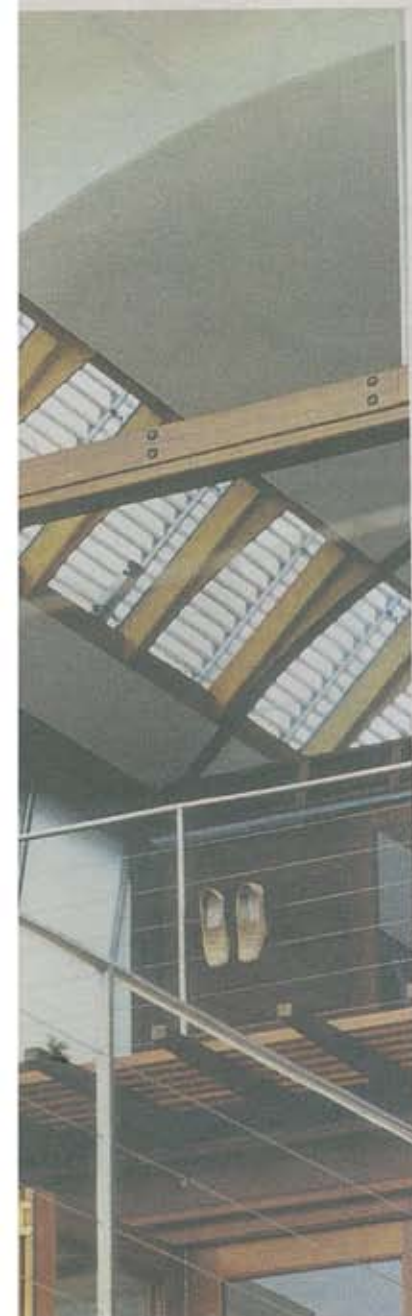
CROSS-VENTILATION AND ADJUSTABLE LOUVRES IN A HOUSE BY ARCHITECT STEVE LESIUK AT CAMP COVE IN SYDNEY.

BASIX basics Building Sustainability Index (BASIX) was introduced in July 2005 to ensure new houses are more energy- and water-efficient. New houses must have water-saving taps and shower heads. Many properties now have water tanks connected to the toilet and laundry. Eaves, orientation and shading are priorities in house design to reduce power usage. BASIX requires all new houses in NSW to produce up to 40 per cent less greenhouse gases than the average home. For more information see www.basix.nsw.gov.au .