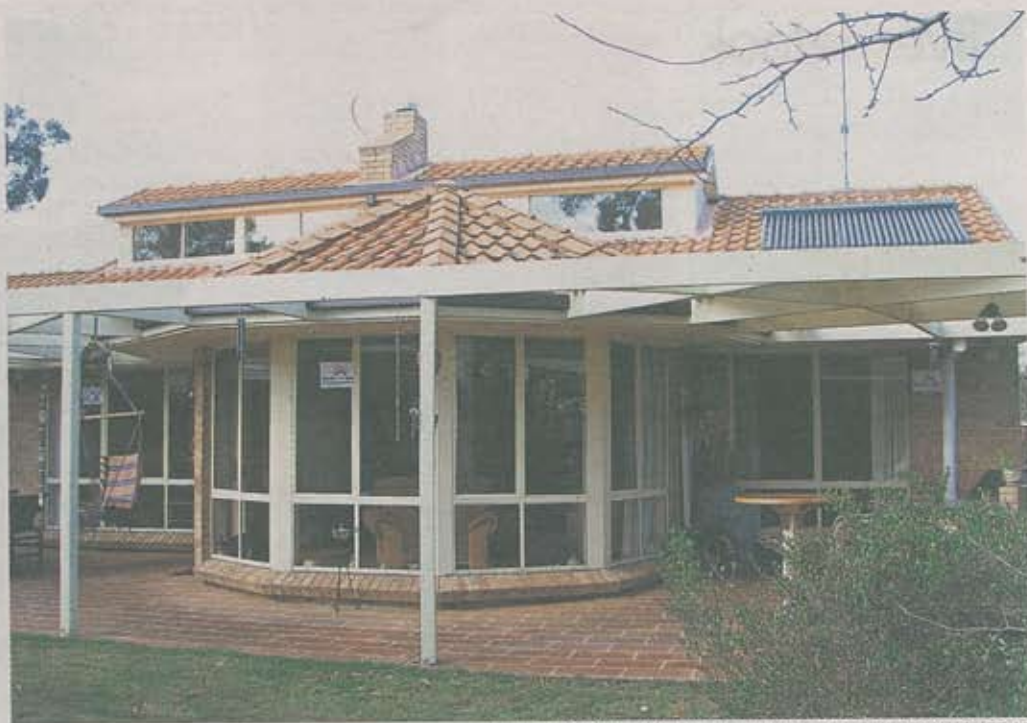
THE LEVER HOME, AN AWARD-WINNING ECO-FRIENDLY HOUSE AT GLENHAVEN, WILL BE OPEN FOR THE SUSTAINABLE HOUSE DAY EVENT.